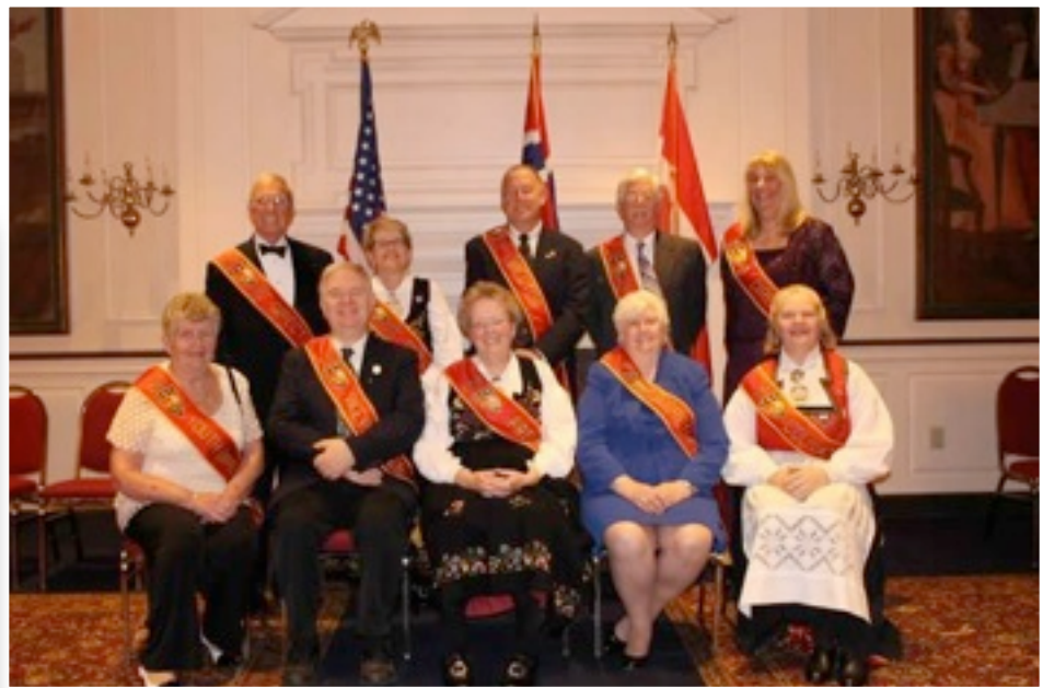
Above: The new Third District Board for 2014-2016.