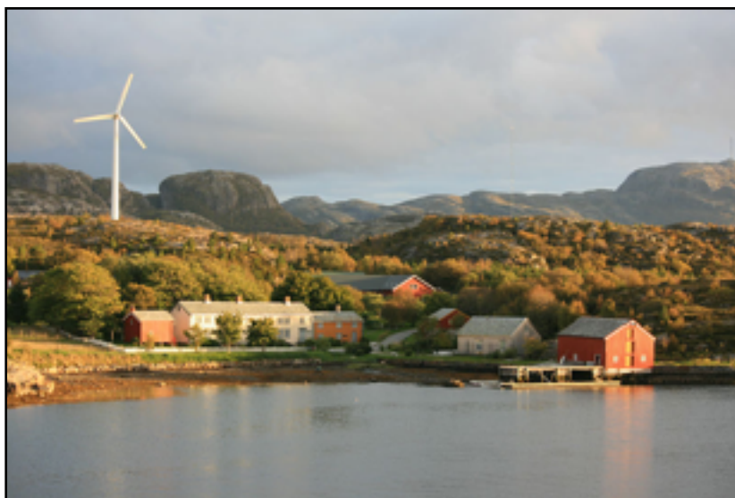
Photo: A wind turbine in Bjugn. Credit: Marius Meyer via Creative Commons .

Courtesy Sons of Norway Newsletter Service.