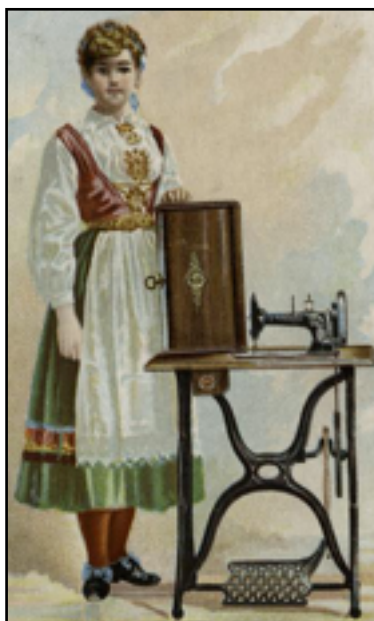
Pictured: Norwegian bunad in a Singer Manufacturing Co. advertisement from 1892.