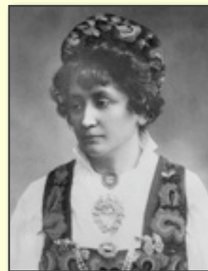
Pictured: Hulda Garborg

Hulda Garborg (1862-1934) was a Norwegian writer, novelist, playwright, poet, folk dancer, and theatre instructor who is often cited as a pioneer in bringing bunads into mainstream culture. She wrote several books, including one on the bunad tradition: Norsk klædebunad (1903).